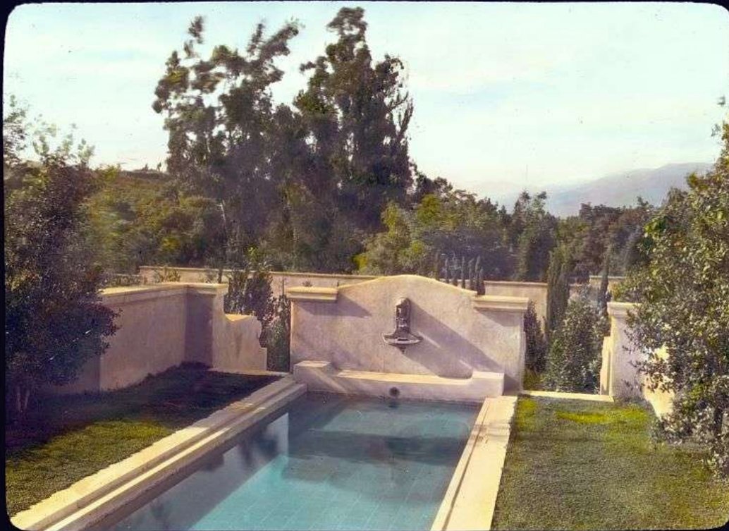
(hand-colored glass lantern slide)