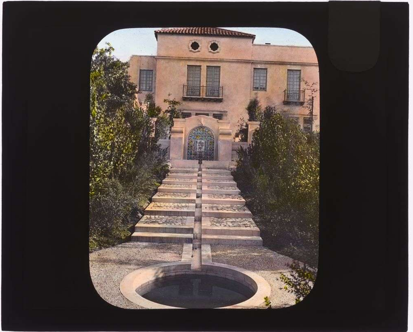
Photo from Library of Congress website, Francis Benjamin Johnston Collection (hand-colored glass lantern slide)